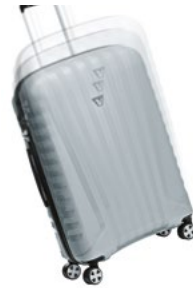
Dropping test: at full load.