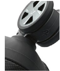
Wheels test: 32.000 m at full load.