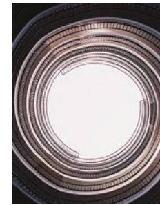
Tumble test: 20 cycles at full load.