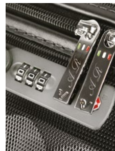
Locks/zips: 7.500 opening/ closing movements.