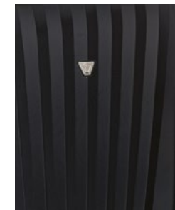
Fabric: abrasion test, color fastness and tear test.